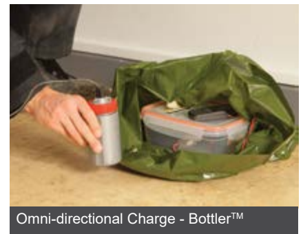
Omni-directional Charge - Bottler™