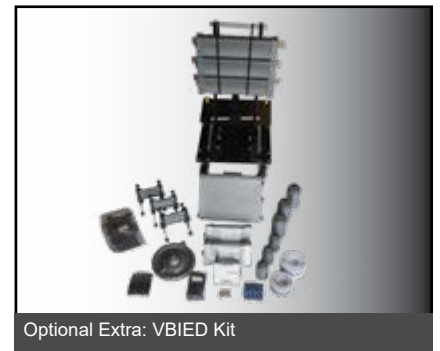
Optional Extra: VBIED Kit