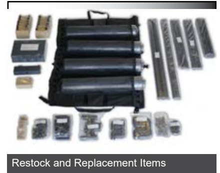
Restock and Replacement Items