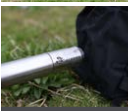
Draken positioning on target