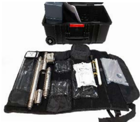
Draken tool roll and protective case