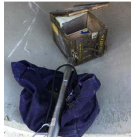
Draken before IED disruption