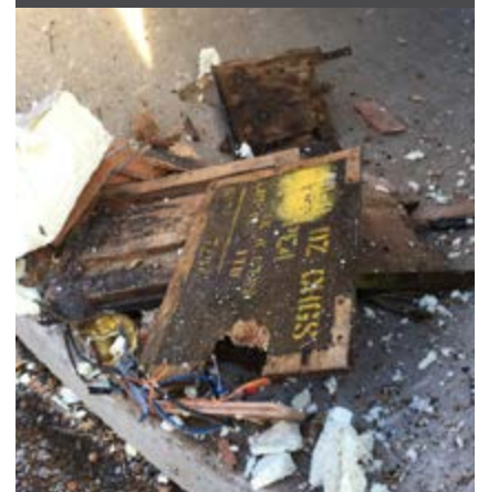
Draken IED disruption results