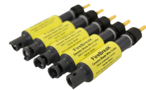
5 cutters in one pack